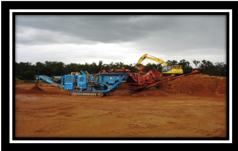
Crushing and screening operations.