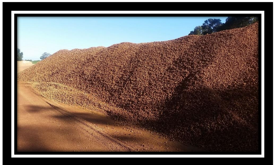
Roadbase and gravel supplies (MRD spec)