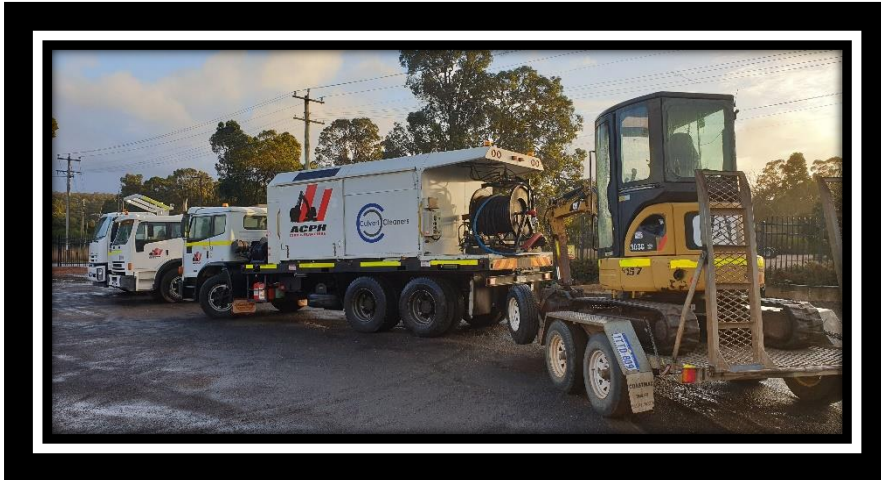
Culvert Jetting Equipment