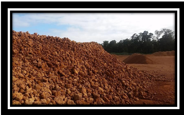
Drainage and Pitching Rock (50-150mm, 300mm, 400mm)